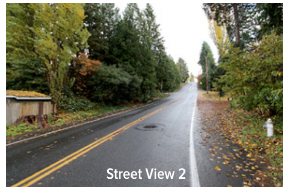
Street View 2