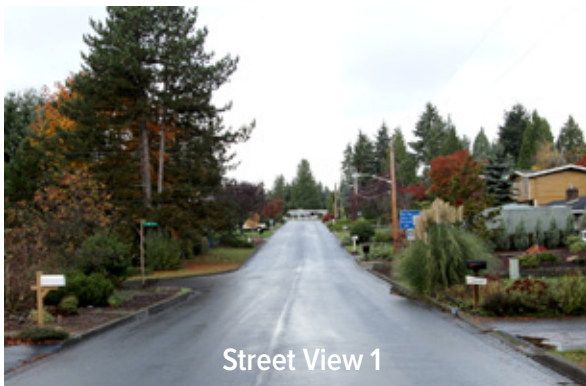
Street View 1